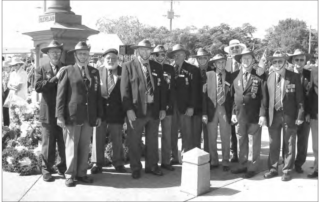
Photo: Some of our members after the service.