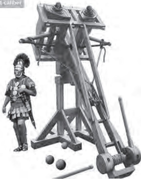
Rome ballista of 1/2 talent caliber

The Greeks and the Romans made the first mechanical innovations using twisted strips of animal hide to propel rocks and iron arrow bolts from large mechanical crossbows or catapults with names such as the Ballista (at left), Scorpion and Onager. Gruesome testimony to their effectiveness was found at Maiden Castle in Dorset, England, stormed by the 2nd Legion (Augusta) in AD43 under a future Emperor, Vespasian, during the Roman invasion of Britain. One of the defenders was buried in a hastily dug grave still with a ballista bolt stuck in his spine.